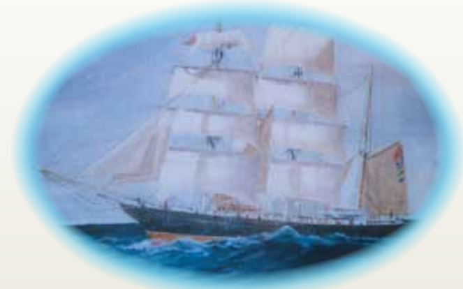
The "Royal Tar"

Discover the fascinating history of the Nambucca Valley from its early days as a pioneer settlement. See a wonderful collection of early Australian memorabilia.